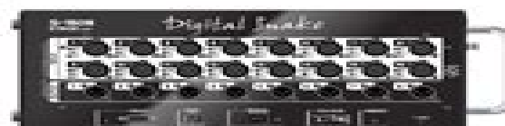
S-1608 STAGE UNIT