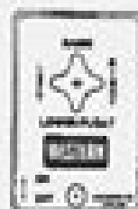
Style 1 Control Label

If test light is ON when chart indicates it should be OFF replace printed circuit board in control box.