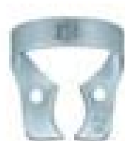
26 Universal molar clamp.