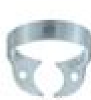
W8A Universal molar clamp.