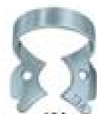
13A Unilateral molar clamp.