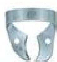
24 Unilateral molar clamp.