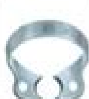
W2A Universal premolar clamp.