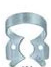
12A Unilateral molar clamp.