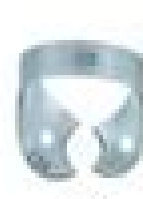
139 Unilateral molar clamp.