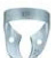
25 Unilateral molar clamp.