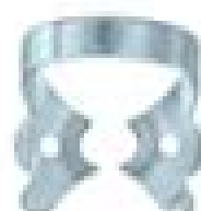
1 Universal canine & premolar clamp.