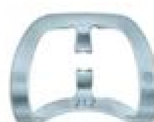
212 Best for class V restorations.