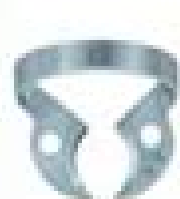
W3 Universal molar clamp.