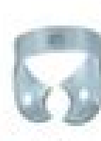
138 Unilateral molar clamp.