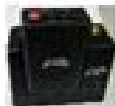
Digital Wireless Mic Receiver & Transmitter