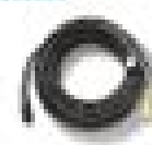
Control Panel Cable