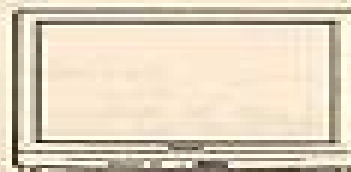
CT-27L8 CT-27L8S CT-32L8