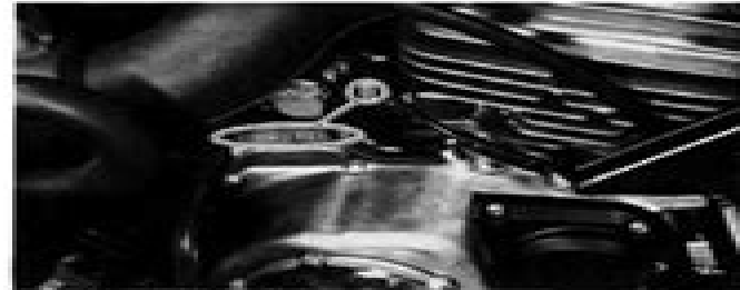
1. Engine serial number

The engine serial number is stamped into the elevated part of the right rear section of the engine.