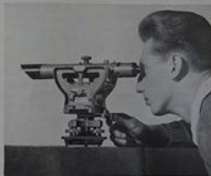
Fig. 5—The instrument being used on a tripod.

To Set Up for Leveling. If the ground is irregular, face uphill. Holding a tripod leg in each hand place the third leg on the higher ground (Fig. 3). Pull the two legs outward and backward and place them on the ground so that they are well spread out and so that the tripod plate is nearly level. Push each leg firmly into the ground by pressing the spur on each leg with the heel.