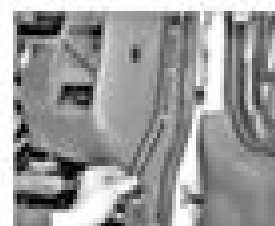
11.46d Release the retaining clip and remove the head upper from the face on both sides