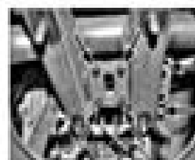
11.46c Under the six bolts (previously) securing the head, insert support brackets to the bottom