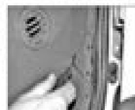
11.46e Using a small screwdriver, release the bolt covers from the face on both sides