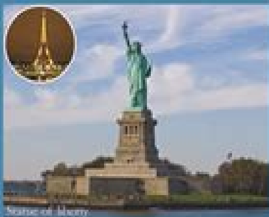
Statue of Liberty