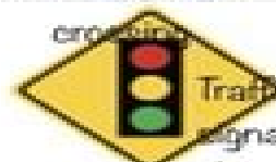
(s) Traffic signal ahead