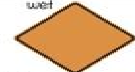
(p) Road construction / maintenance area