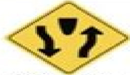
(j) Divided highway