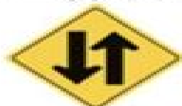
(v) Two way traffic