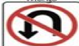
(r) No U-Turn