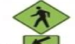
(o) Pedestrian crossing