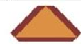
(t) Slow moving vehicle