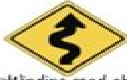
(b) Winding road ahead