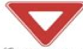
(d) Yield right of way