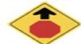
(x) Stop sign ahead