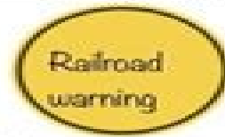
(g) Railroad warning