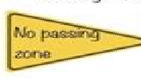
(h) No passing zone