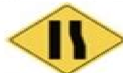
(w) Reduction in lanes