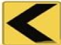
(f) Dead-end road