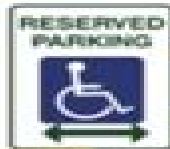
(i) Reserved parking