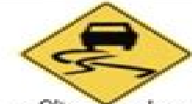
(l) Slippery when wet