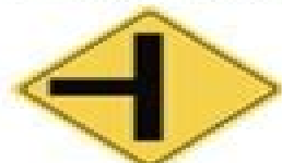
(u) Side road