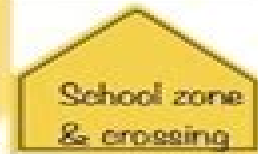
(e) School zone & crossing