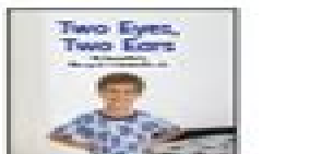
6Two Eyes, Two Ears* F&P: D | Lexile: 230L RigbyLevel: 5/6