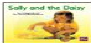
Sally and the Daisy* F&P: C | Lexile: 100L RigbyLevel: 4