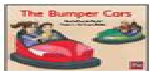
The Bumper Cars* F&P: C | Lexile: 210L RigbyLevel: 4