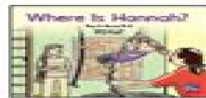
Where Is Hannah?* F&P: D | Lexile: 190L RigbyLevel: 5