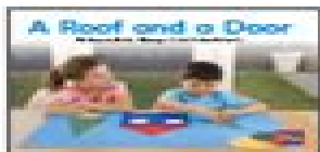
6A Roof and a Door* F&P: D | Lexile: 180L RigbyLevel: 5/6