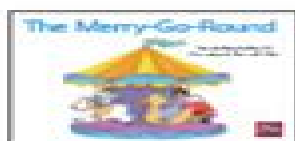
The Merry-Go-Round* F&P: C | Lexile: 140L RigbyLevel: 3