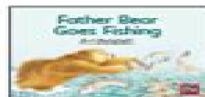
Father Bear Goes Fishing* F&P: D | Lexile: 210L RigbyLevel: 5