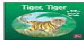
Tiger, Tiger* F&P: C | Lexile: 90L RigbyLevel: 3