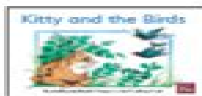
Kitty and the Birds* F&P: C | Lexile: 150L RigbyLevel: 4