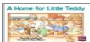
A Home for Little Teddy* F&P: D | Lexile: 190L RigbyLevel: 5