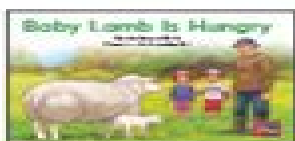
Baby Lamb Is Hungry* F&P: C | Lexile: 220L RigbyLevel: 4