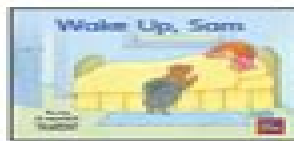
Wake Up, Sam* F&P: C | Lexile: 120L RigbyLevel: 3