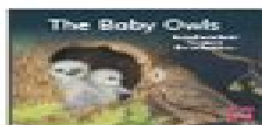
The Baby Owls* F&P: C | Lexile: 180L RigbyLevel: 4