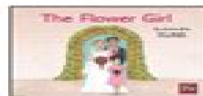
The Flower Girl* F&P: C | Lexile: 210L RigbyLevel: 4