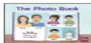
The Photo Book* F&P: C | Lexile: 40L 1 RigbyLevel: 3