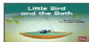
Little Bird and the Bath* F&P: C | Lexile: 150L RigbyLevel: 3