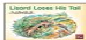
Lizard Loses His Tail* F&P: D | Lexile: 160L RigbyLevel: 5