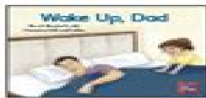
Wake Up, Dad* F&P: C | Lexile: 10L RigbyLevel: 3