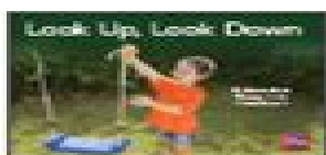
6Look Up, Look Down* F&P: D | Lexile: 150L RigbyLevel: 5/6