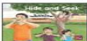
Hide and Seek* F&P: D | Lexile: 190L RigbyLevel: 5