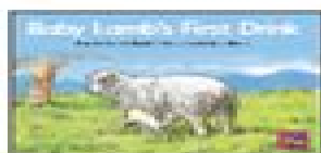
Baby Lamb's First Drink* F&P: C | Lexile: 140L RigbyLevel: 4