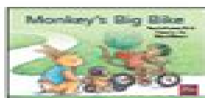
Monkey's Big Bike* F&P: C | Lexile: 350L RigbyLevel: 3