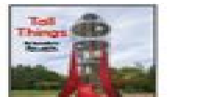
6Tall Things* F&P: D | Lexile: 150L RigbyLevel: 5/6