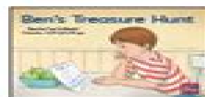
Ben's Treasure Hunt* F&P: D | Lexile: 180L RigbyLevel: 5