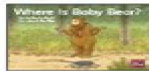
Where Is Baby Bear?* F&P: D | Lexile: 170L RigbyLevel: 5