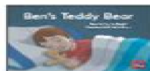
Ben's Teddy Bear* F&P: D | Lexile: 110L RigbyLevel: 5