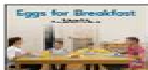
6Eggs for Breakfast* F&P: D | Lexile: 140L RigbyLevel: 5/6