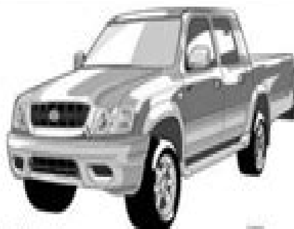
Radiator Grill and Front Bumper