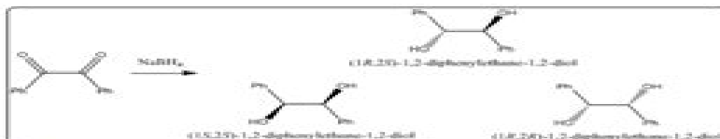
Figure 3: Reduction of Benzil to hydrobenzoin with Possible Formation of Three Stereochemical Products.