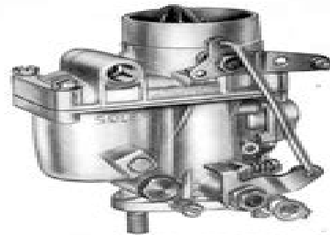
Type 28 PCI (Downdraught Carburetor)