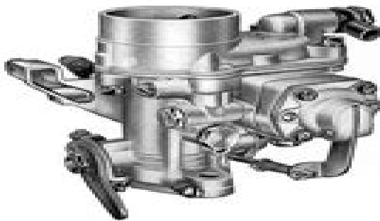
Type 32 PICB (Downdraught Carburetor)