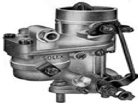
Type 28 VFIS (Downdraught Carburetor)