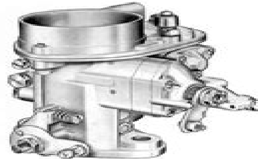
Type 40 ICB (Downdraught Carburetor)