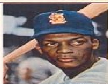
BASEBALL STAR CARD No. 178