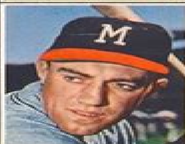
BASEBALL STAR CARD No. 114