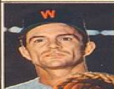
BASEBALL STAR CARD No. 96