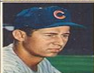
BASEBALL STAR CARD No. 196