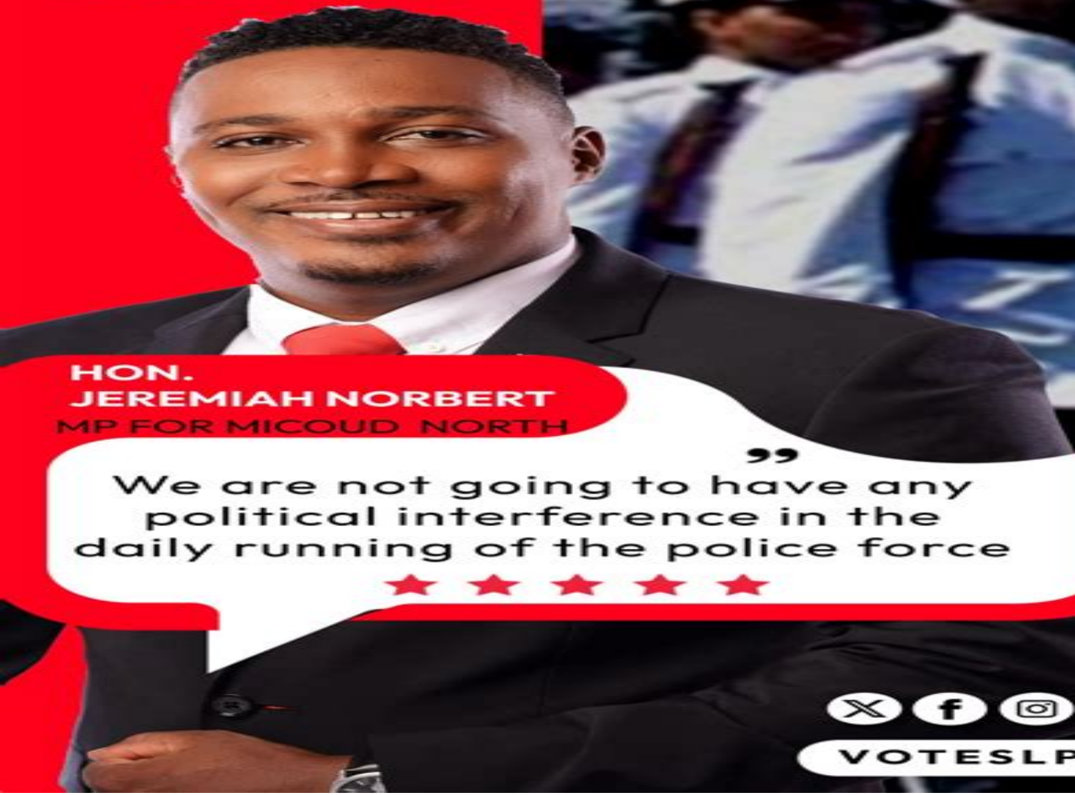
HON. JEREMIAH NORBERT MP FOR MICOUD NORTH