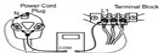
Figure 4. Plug-to-terminal connections for electric dryer.