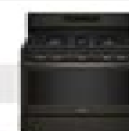
Fingerprint Resistant Black Stainless Steel (F)