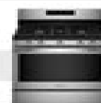
Fingerprint Resistant Stainless Steel (S)