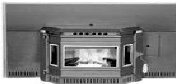
Freestanding Model Advantage B-T C INS

These appliances must be properly installed and operated in order to prevent the possibility of a house fire. Please read this entire owner's manual before installing and using your pellet stove. Failure to follow these instructions could result in property damage, bodily injury or even death. Contact your local building or fire officials to obtain a permit and information on any installation requirements and inspection requirements in your area.