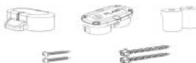
A. Smart Vent