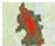
Hamilton, OH Impervious Surfaces