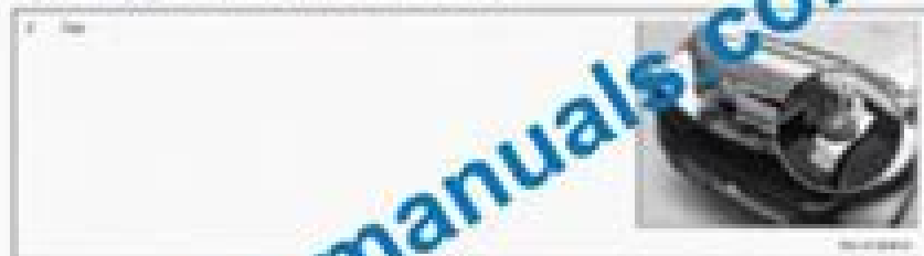
Fig. 1 Identifying Brake Fluid Expansion Reservoir Cap