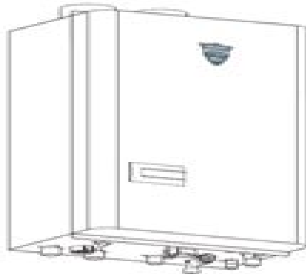
For possible water heating and space heating