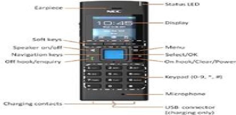
G266 Front View