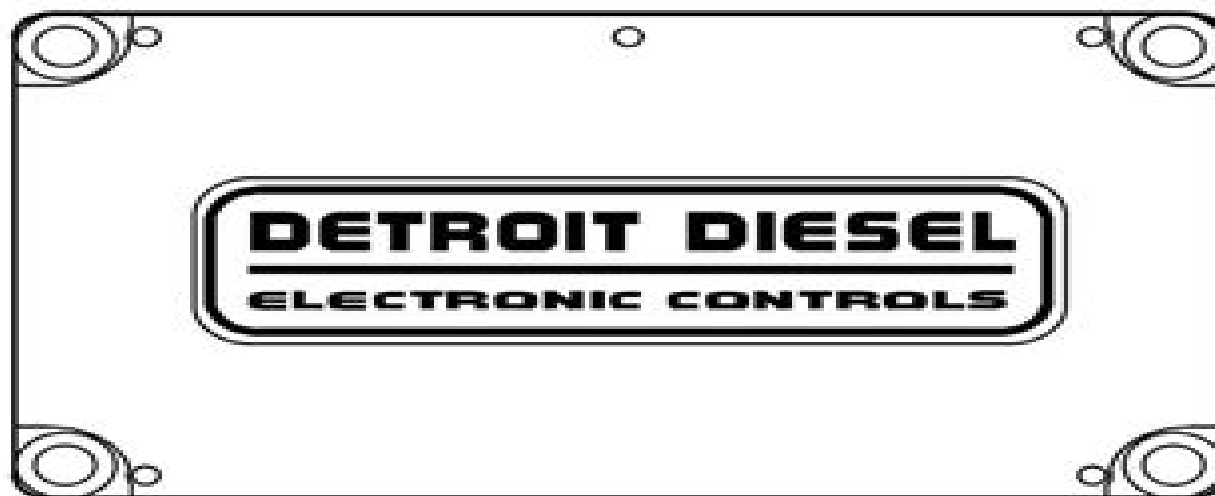
DDEC III / IV ECM FRONT SIDE