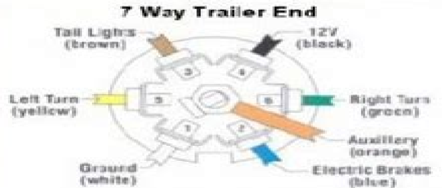
7 Way Trailer End