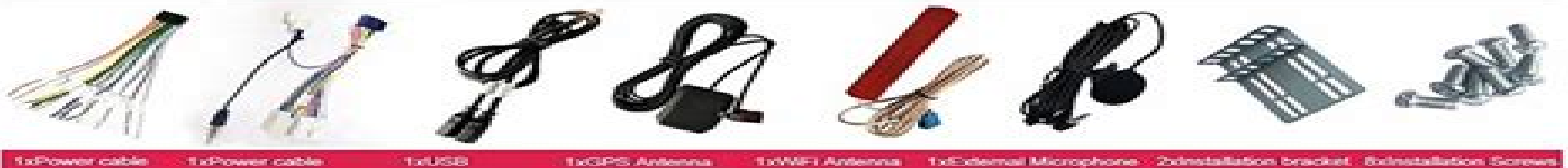
1xPower cable 1xPower cable 1xUSB 1xGPS Antenna 1xWiFi Antenna 1xExternal Microphone 2xInstallation bracket 5xInstallation Screws