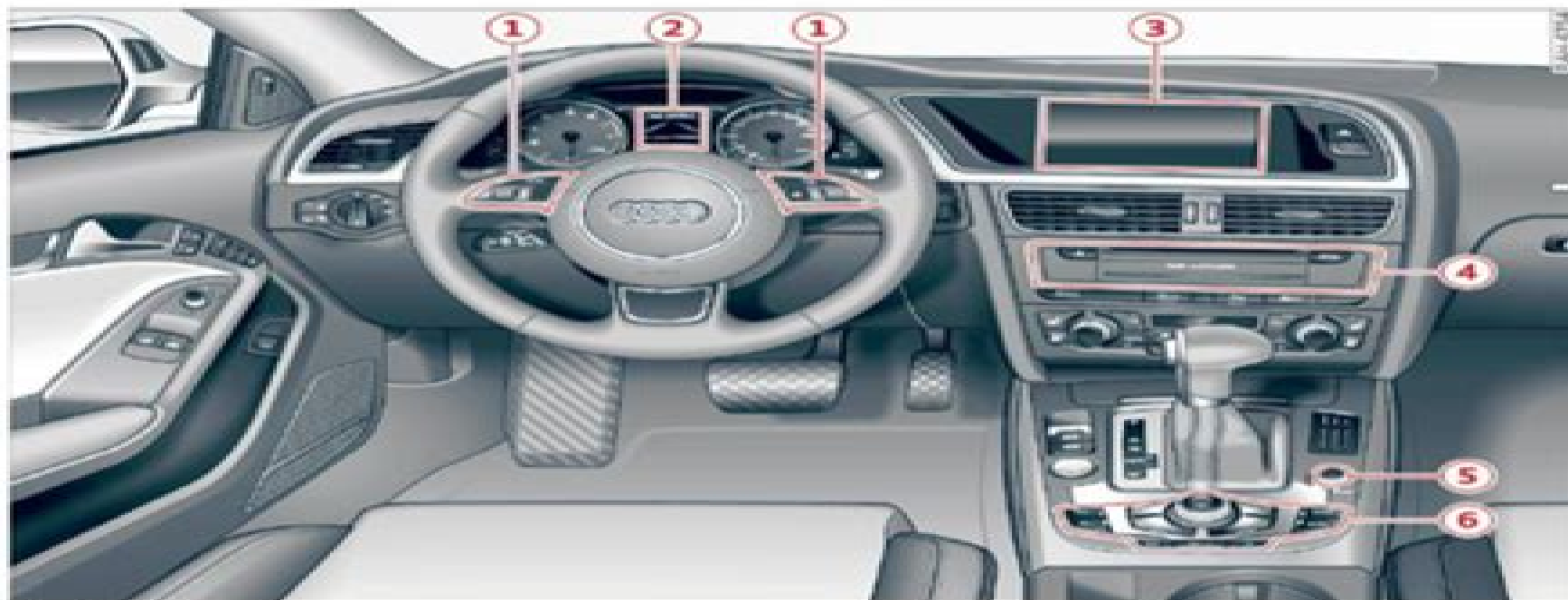
Fig. 1 MMI controls

The Multi Media Interface, or MMI for short, combines various systems for communication, navigation* and entertainment in your Audi.