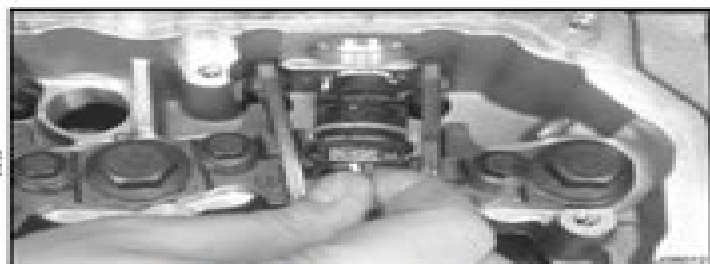
Figure 250 Installing the injector harness connector