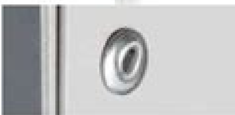
Pull trigger to tighten the rivet.