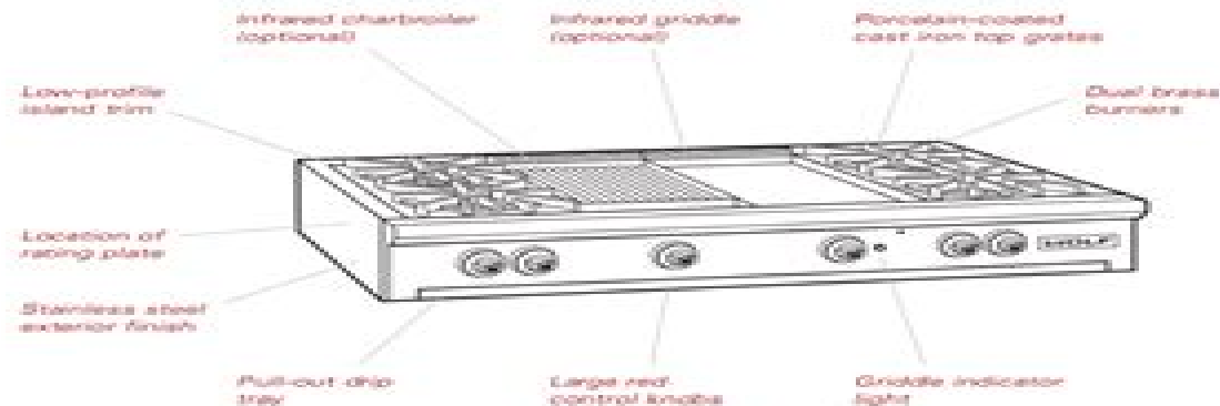
Model RT486CG shown.

► The Wolf 48" (1219) gas rangetop is available in natural or LP gas, with your choice of several top configurations. Model numbers indicate the features: (C) charbroiler, (G) griddle, (DG) double griddle and (F) French top. The model number followed by (LP) denotes an LP gas model.