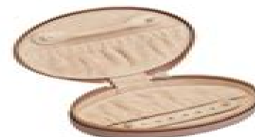
8. TRAVEL JEWELRY CASE