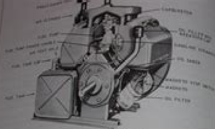
Fig. 1 LARGEST SIDE VIEW OF ENGINE