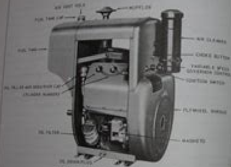
Fig. 1 POWER UNIT FAR END VIEW OF ENGINE