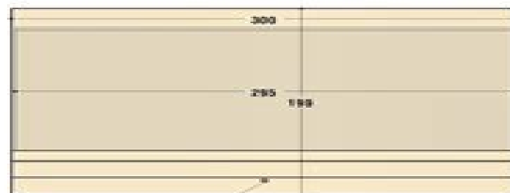
FRONT ELEVATION SCALE 1 : 4