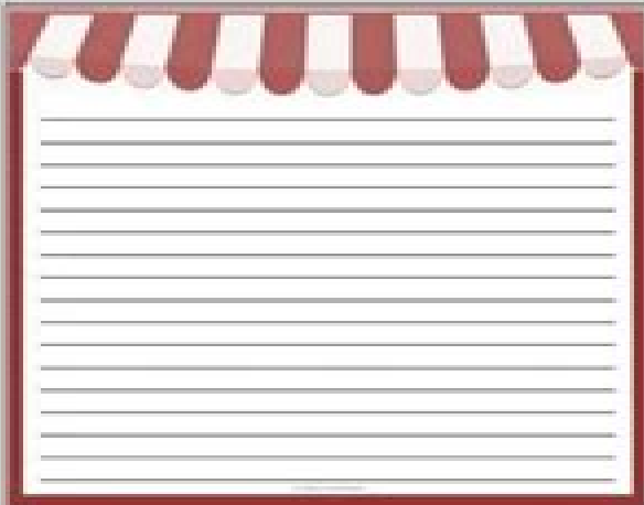
Stationary-Thematic Writing Paper - designs by Lisa