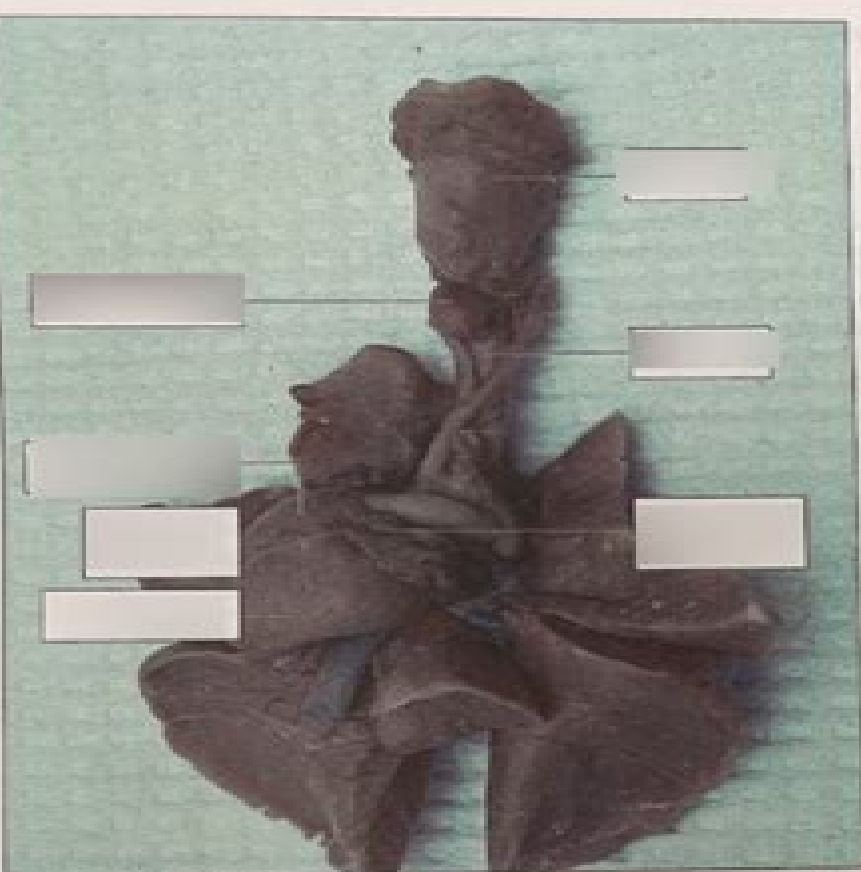
a Ventral view