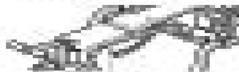
Correct Position (Illustration: Correct)

Observe and follow all the instructions for correct operation.