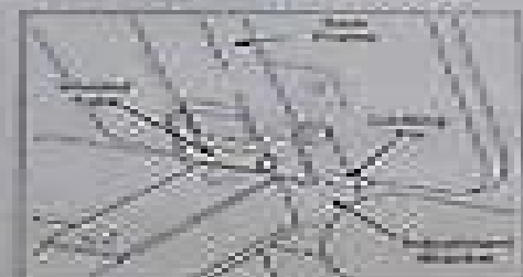
SETTING UP THE WEIDER PRO FOR STANDING POSITION

To set up the machine for standing, first adjust the resistance band to the desired position. Then, adjust the machine to the desired position. The machine is designed to be used in a standing position.