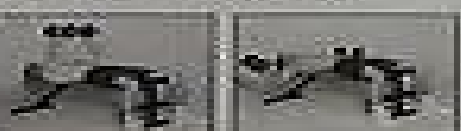
Lying Position Stand your knees up and raise the resistance to the level.