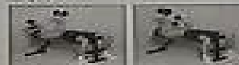
Standing Position Stand on your feet and raise your arms above your head to the shoulder level.