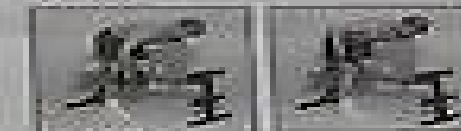
Standing Position Stand on your feet and raise your arms above your head to the shoulder level.