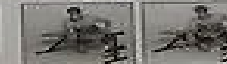
Standing Position Stand on your feet and raise your arms above your head to the shoulder level.