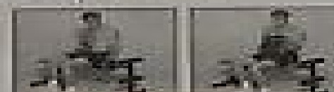
Standing Position Stand on your feet and raise your arms above your head to the shoulder level.