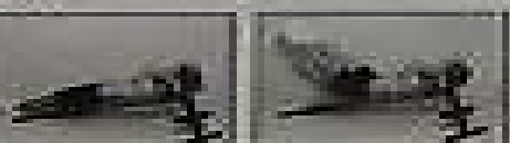
Leg Position Use your adjustment features to sit on a bench with back support.