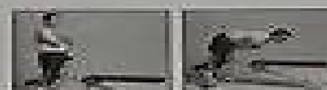
Standing Position Stand on your feet and raise your arms above your head to the shoulder level.

WARNING: Always use proper form when using the machine. Always stand on the feet and keep the feet flat on the floor. Do not use the machine if you are injured or if you are pregnant.