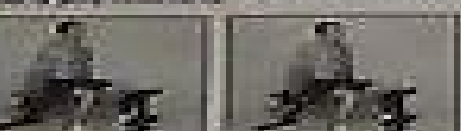
Shoulder Position Stand your knees up and raise your arms above your head to the shoulder level.