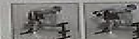
Standing Position Stand on your feet and raise your arms above your head to the shoulder level.