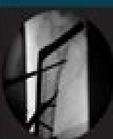
Image 2 was taken with Penetration feature and shows the anatomy with excellent detail compared to image 1 captured without Penetration feature.