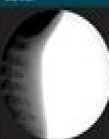
Correct bone OP Corner without Penetration