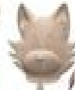
Cat Head Cartoon 2-X