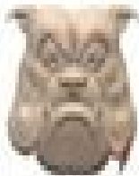
Bulldog Head Cartoon