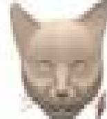
Cat Head Cartoon 1-X