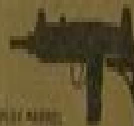
WITH SUPPRESSOR MAG