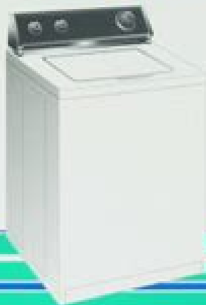
Automatic Washer (Direct Drive)

Easy-to-Follow Photographs and Step-by-Step Repair Procedures