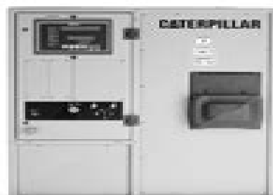
Common Design EMCP II