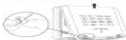
Figure 1. Removing the cover

Use the supplied 3mm x 16mm (M4x) screws for the tamper block.