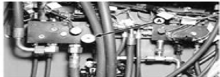
Left-Hand Side of Windrower