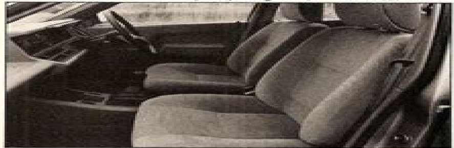
Oddment accommodation is good and seats softly padded