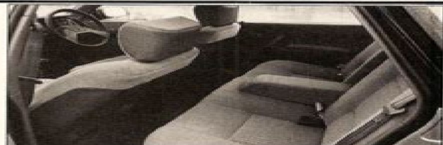
Generous proportions means plenty of legroom, front and rear

Front suspension is by MacPherson struts, coil springs, and with additional control provided by a 25mm anti-roll bar. The rear is by