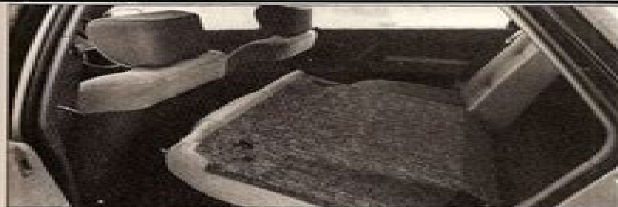
One third/two thirds split rear seat gives useful versatility