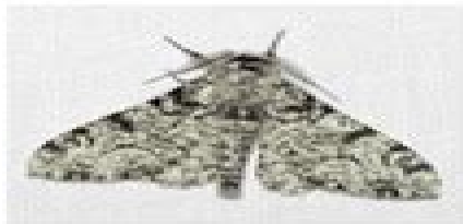
1. Light gray peppered moth

Before the year 1845, in the city of Manchester, England a population of light gray colored moths known as Peppered moths lived in the surrounding forests. They would cling to the trunks of trees that were covered with a light gray colored bark, like them.