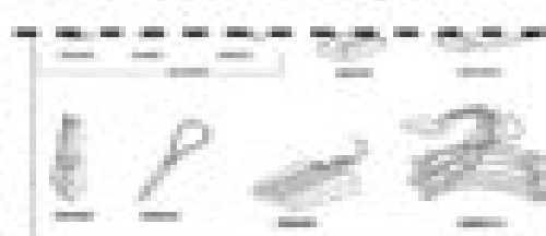
Diagram showing the engine assembly and its location within the vehicle chassis.