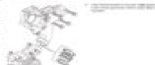
Diagram showing the engine assembly and its location within the vehicle chassis.