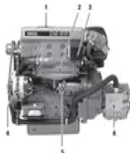
Co-55 A/B with reverse MDCIL