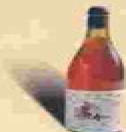
FRAMBOISE + Belgium