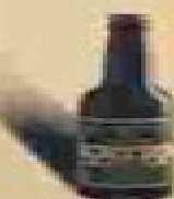
IRISH ALE + Ireland