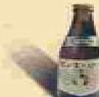
TRAPPIST ALE + Belgium