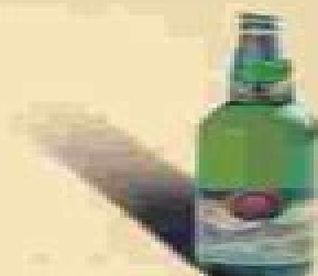
ORIGINAL PILSENER + Germany