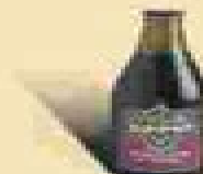
PORTER + England