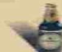
PILSNER + Germany