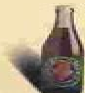
WHEAT BEER + Austria