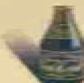
MUNICH-STYLE + Germany