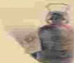
DOUBLE ROCK + Germany